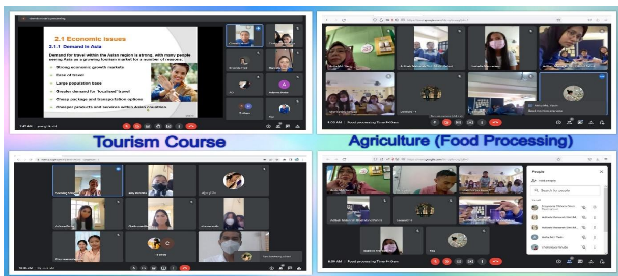
Photo of Classes from Cambodia