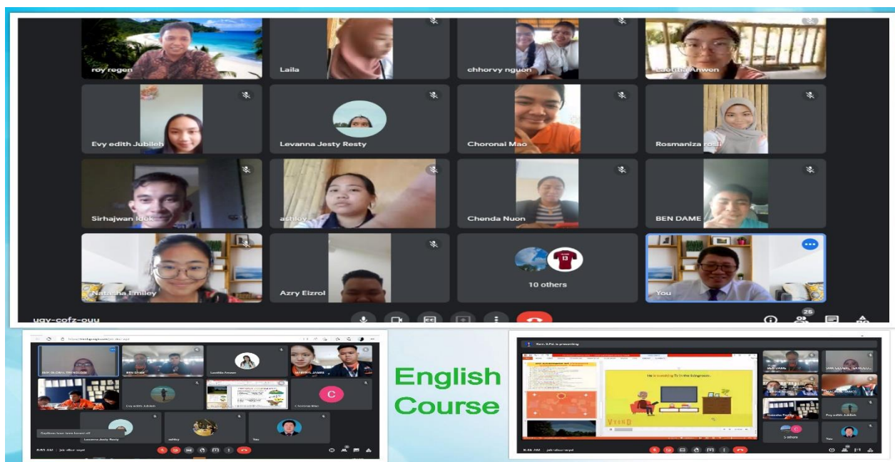
Photo of Classes from Indonesia