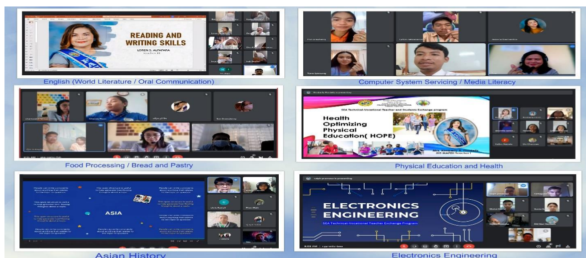
Photo of Classes from the Philippines