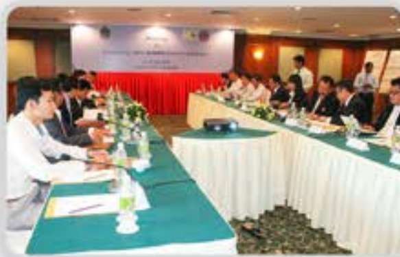
Workshop on Establishing SEAMEO TED in Phnom Penh on 27-29 July 2015

EC took note and supported the request from MoEYS of Cambodia on the proposal on establishing a SEAMEO Regional Centre for Technical Education Development (SEAMEO TED) in Cambodia and to seek the endorsement from the 39th SEAMEO High Officials Meeting on the said proposal to the SEAMEO Council for approval.