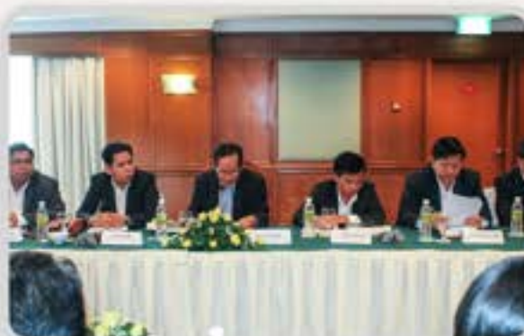
Cambodian MoEYS Officials Attending the 27-29 July Workshop