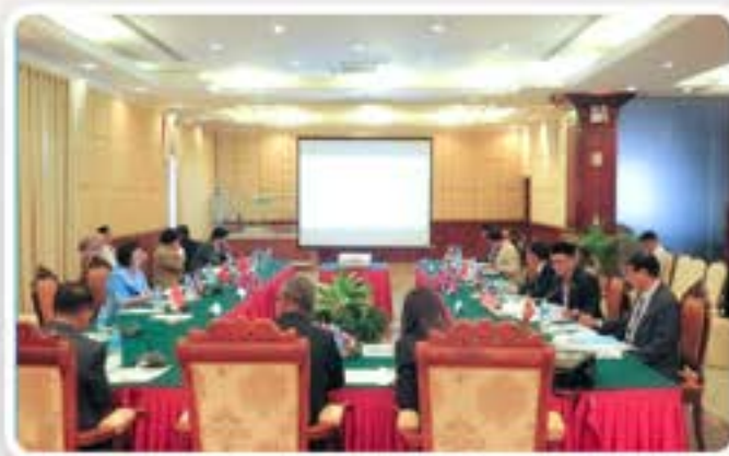
SEAMEO TED's 1st Governing Board Meeting

SEAMEO TED organizes the Governing Board Meeting annually in purposes of discussing and endorsing significant points of actions such as center's annual achievements, proposed activities, and strategic plan.