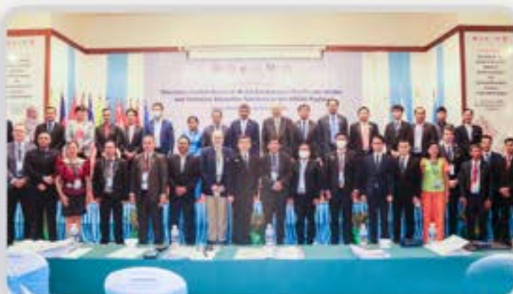
Regional Workshop on "The Labor Market Needs in IR 4.0 Era between the Private Sectors and Technical Education Teachers in the ASEAN Region"