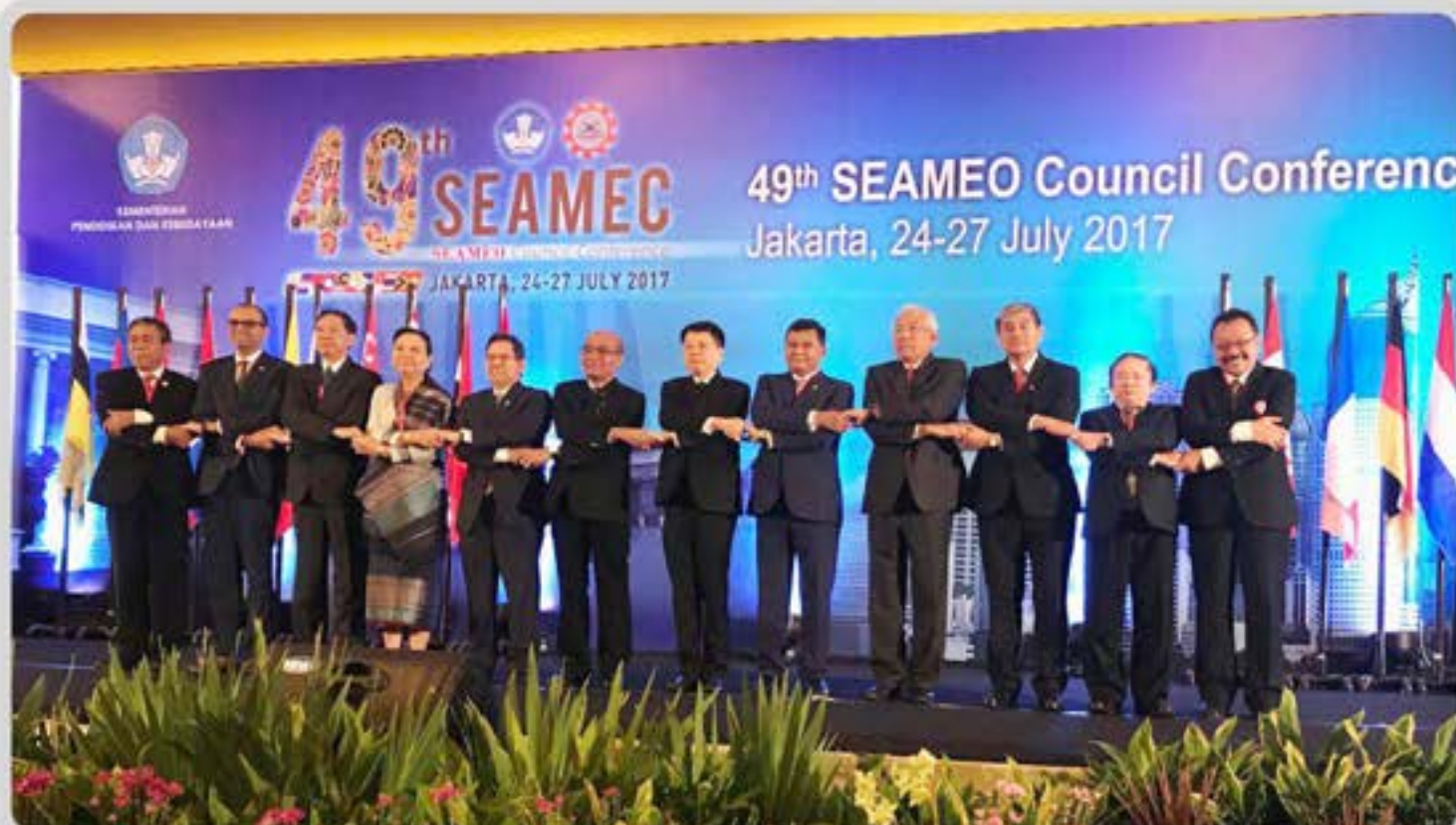
Council of Ministers of Education of 11 SEAMEO Member Countries and Director of SEAMEO Secretariat at the 49th SEAMEO Council Conference on 25 July 2017 in Jakarta, Indonesia.

Finally, SEAMEO TED was established by the Royal Government of Cambodia with the sub-decree No. 107 dated on June 28, 2017 and endorsed by the SEAMEO Council on July 25, 2017 in Jakarta, Indonesia.