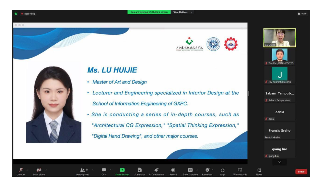
Participants in the Photo Session on March 29, 2024 (Session 3)

In each session, the specialists delivered three important topics including Common Concept Risks and Future, Fundamental of Cloud Computing: Service Types Key Technologies and Deployment and The Application of Extended Reality (XR) Technology in Architecture and Interior Related Fields.