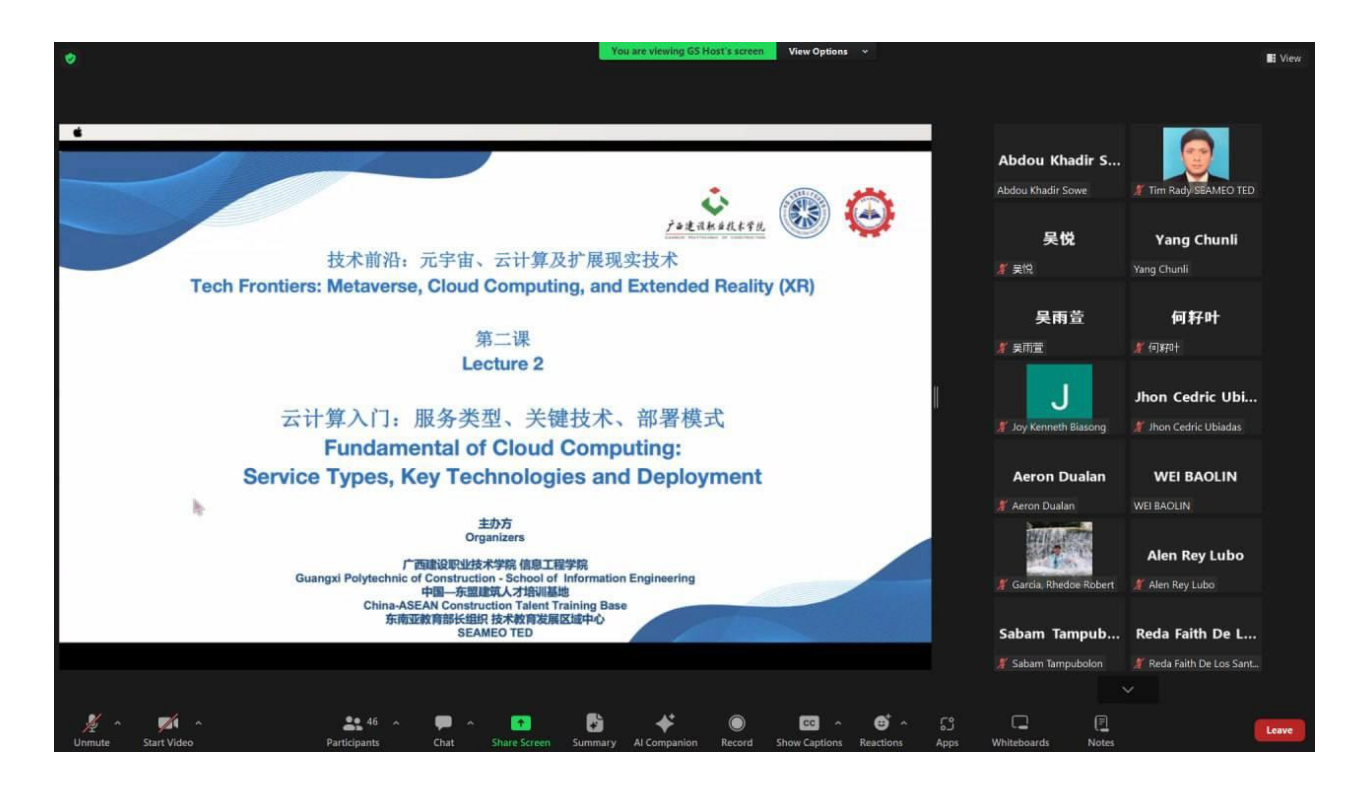
Participants in the Photo Session on March 28, 2024 (Session 2)