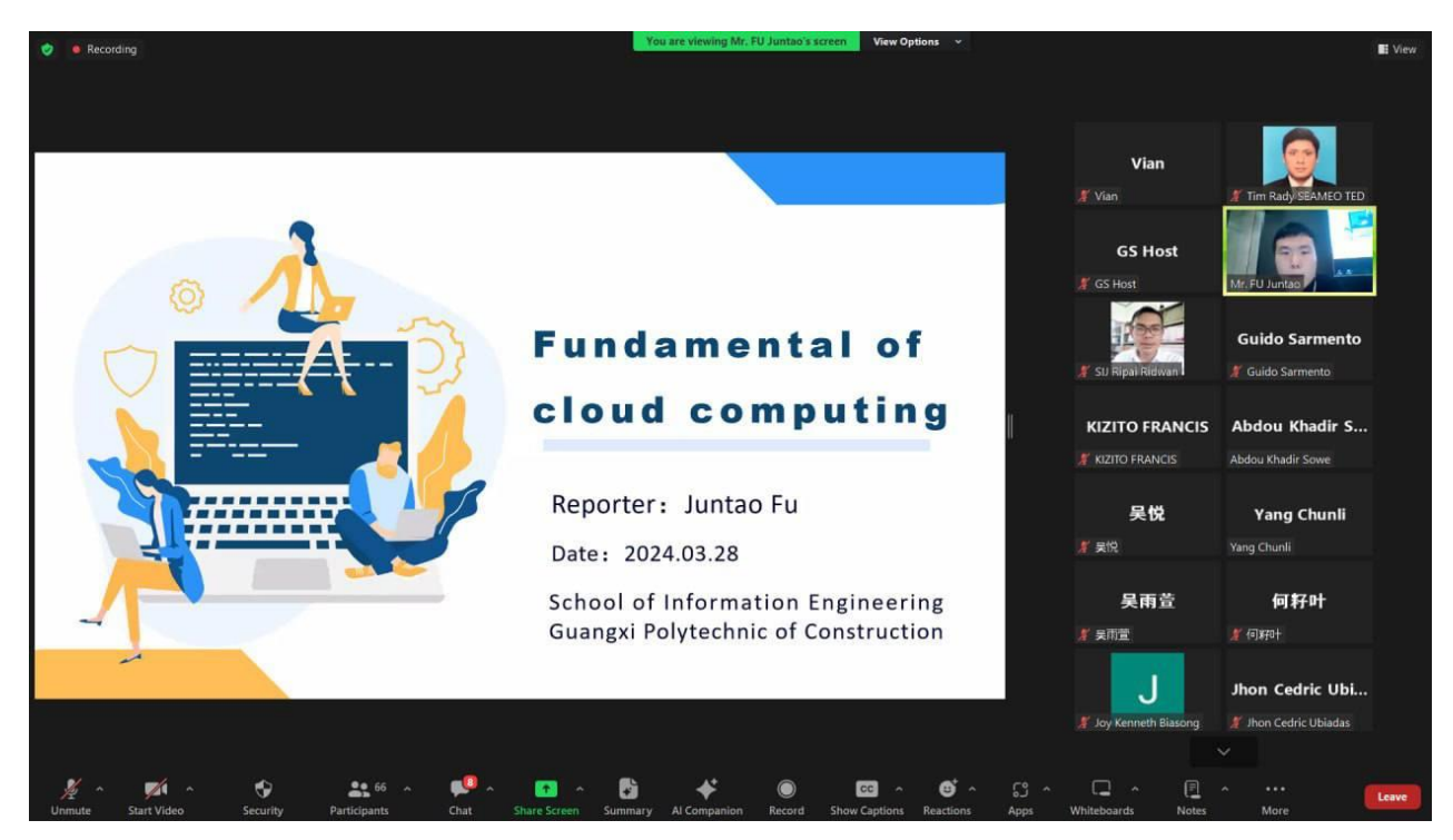
Explanation on Service Types Key Technologies and Deployment