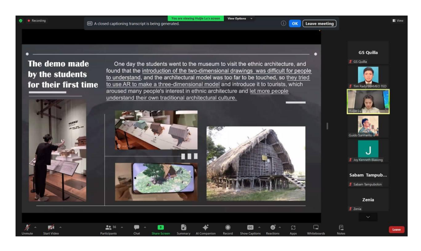
Explanation on The Application of Extended Reality (XR) Technology in Architecture and Interior Related Fields